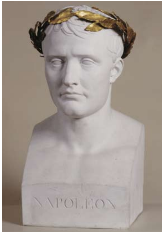
Portrait of Napoléon