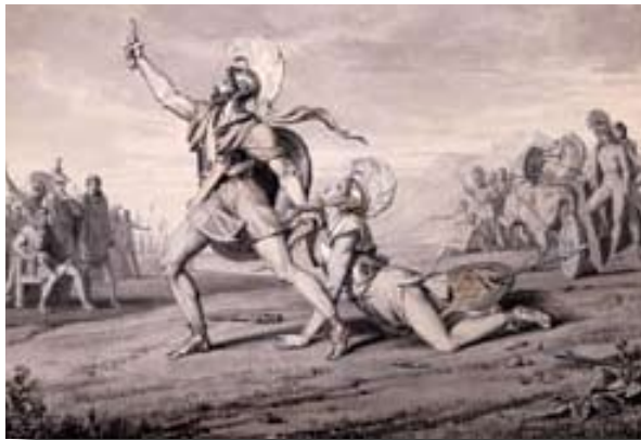
Fight Scene in the Classical style, Horace Vernet, c. 1810, India ink and gouache on paper