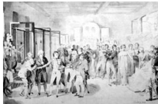
Bonaparte Visiting the Silk Manufacturers of Rouen , Jean-Baptiste Isabey, 1802, India ink and sepia on paper.