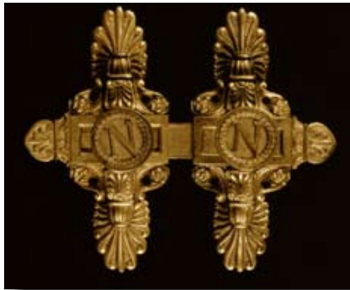
Door Latches from the Emperor's personal Tuileries apartment, Gilded bronze