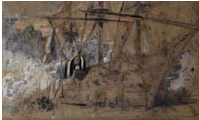
Remains of Napoléon Leaving St. Helena, Louis Gabriel Eugène Isabey (French 1803 – 1886), c. 1840, Gouache on paper