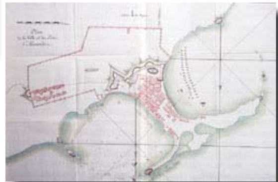
Map of the city and harbors of Alexandria, 1798.