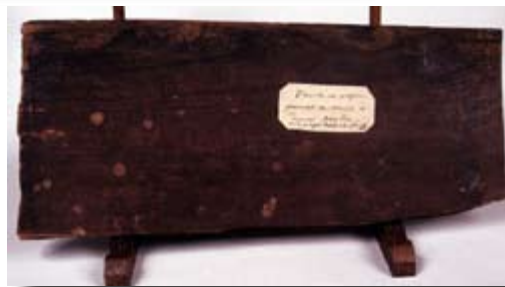
Fragment of Napoléon's Original coffin, 1821, Mahogany