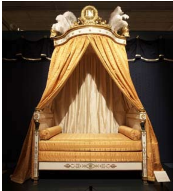
Imperial Bed of Jérôme, the King Jérôme of Westphalia, (Napoléon's Brother), Jacob, c. 1810.