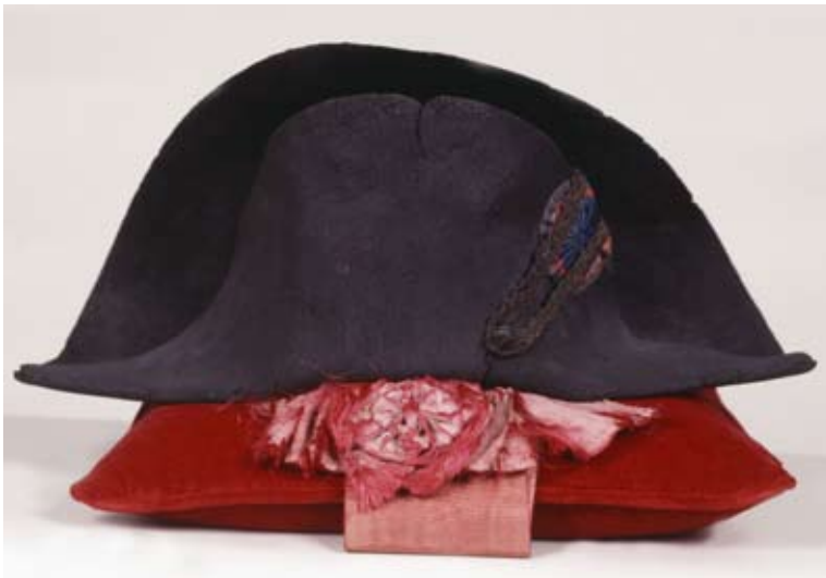
The Emperor's Hat, summer model, Poupard Chapelier, c.1805, felt