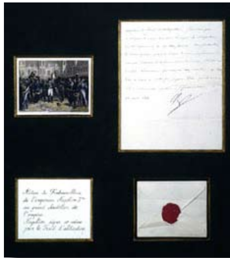
Napoléon's Farewell to Pierre de Montesquiou, Emperor Napoléon I, 1814, ink on paper.