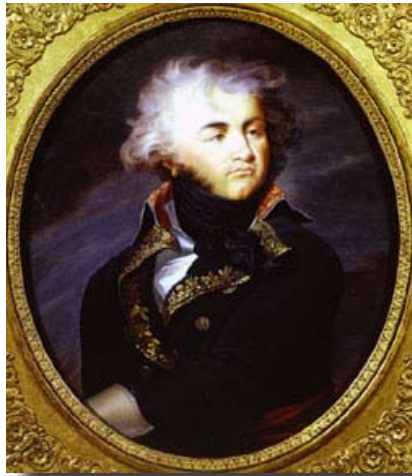
Portrait of Jean-Baptiste Kléber, miniature on ivory by Baron Pierre-Narcisse Guérine (c. 1798) that belonged to Bonaparte