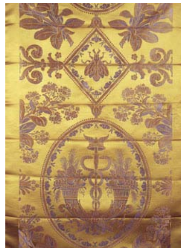
Fabric sample from Versailles, Grand-Frères (silk manufacturer of Lyons), c. 1810-1812