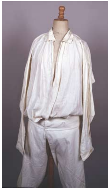
Napoléon's monogrammed shirt and longjohns worn on St. Helena