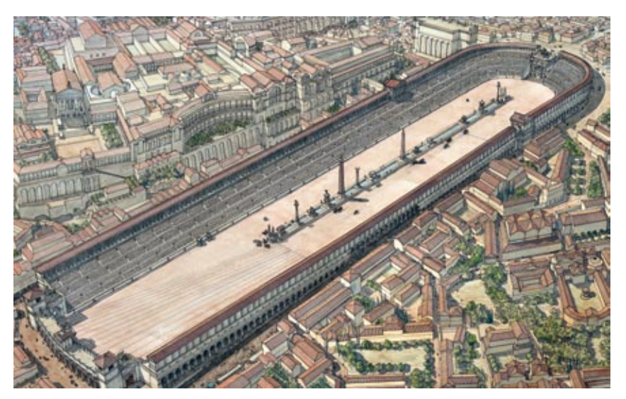
Drawing of the Circus Maximus. Courtesy Jean-Claude Golvin. © 2007

The Circus Maximus, a massive oval-shaped arena in Rome, was used primarily for chariot and mounted horse races, but other competitive events, including foot races and wrestling matches, were also held there. Romans adored chariot racing, and fans gathered in the Circus Maximus to watch